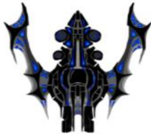
SpaceShip 3 1000 Bullet 100 STARS