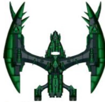
SpaceShip 2 1000 Bullet 100 STARS