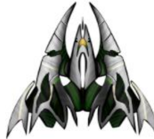
SpaceShip 4 1000 Bullet 100 STARS