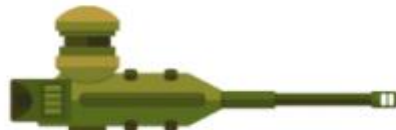
Buttet 2 100 STARS Bullet : 1000