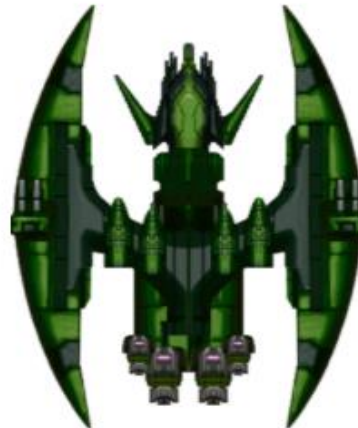
SpaceShip 6 1000 Bullet 100 STARS