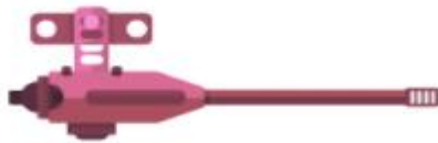
Buttet 1 100 STARS Bullet : 1000