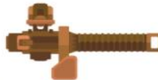
Buttet 4 100 STARS Bullet : 1000