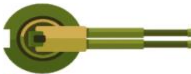
Buttet 5 100 STARS Bullet : 1000