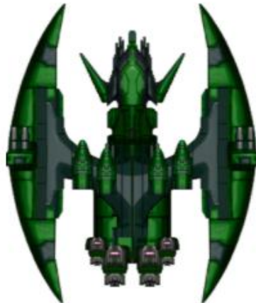
SpaceShip 5 1000 Bullet 100 STARS