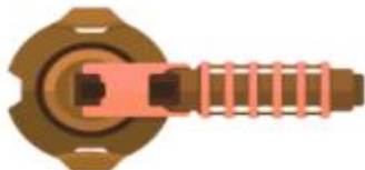
Buttet 3 100 STARS Bullet : 1000