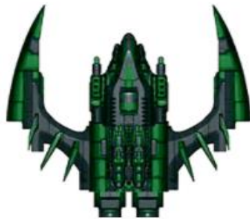
SpaceShip 1 1000 Bullet 100 STARS

The spaceship needed to discovery space!