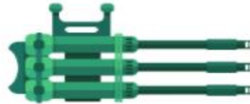
Buttet 6 100 STARS Bullet : 1000